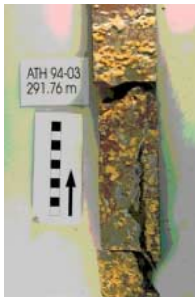
Figure 2. (bottom) Native sulfur crystals line a vertical fracture in bituminous laminites of the Methy (Winnipegosis) Formation, NE Alberta (sample from 291.8 m depth, drill hole ATH 94-03, Lac Minerals). Native sulfur records fracture controlled inflow of saline brines and reduction of sulfate.