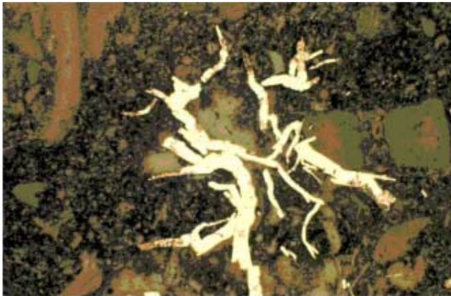
Figure 1. (top) Authigenic pyrrhotite seen in polished thin section in sample taken from 75 m depth, drill hole ATH 94-01, Lac Minerals. The image length is 4 mm. Pyrrhotite locally makes up 1-5% of the calcareous shales of the Waterways Formation (Mid. - Upper Devonian) in NE Alberta. The presence of authigenic pyrrhotite is interpreted to indicate highly reducing conditions associated with bacterial sulfate reduction (BSR) in upflow zones.